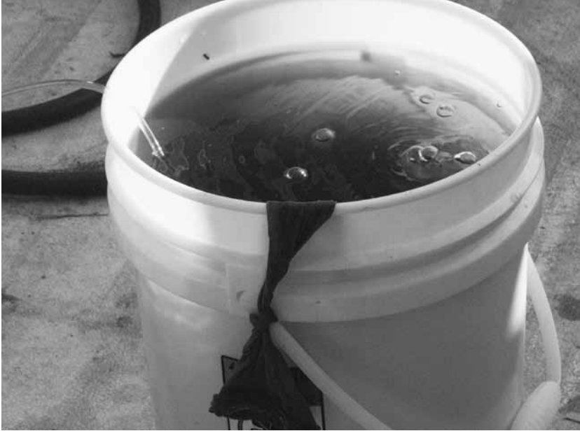
Fig. 4.3: Compost tea . CREDIT: STARHAWK