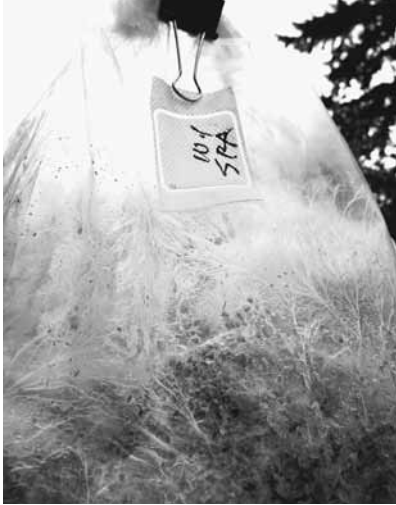
Fig. 6.2: Stropharia rugosoannulata ripping through untreated plain sawdust.

and achieve faster colonization. Things to look out for are any signs of discoloration from competitor molds (e.g. blue, green or gray patches) and slow or no growth. Also, if you wait too long, mushrooms will begin to form in the bag. This is a sign that the fungus has run out of food and needs to be moved onto the final substrate.