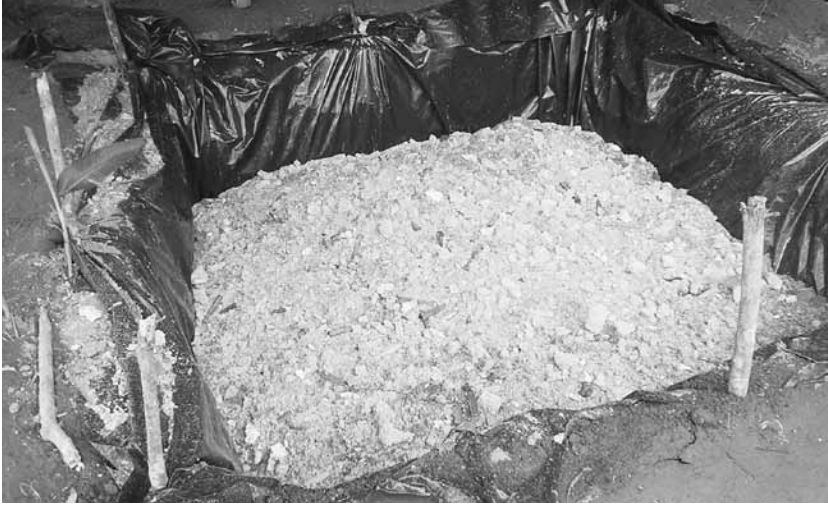
Fig. 6.26: Before image of AMP bioremediation experiment. The experiment evaluated how well Pleurotus (oyster mushroom) would grow on petroleum-contaminated soils in open-air pits lined with pond liner.

reishi; some of these fungi have been shown to be good at remediating contamination. This is also petri-dish work, however then you can get the cultures to grow on more common substrates. People need to not