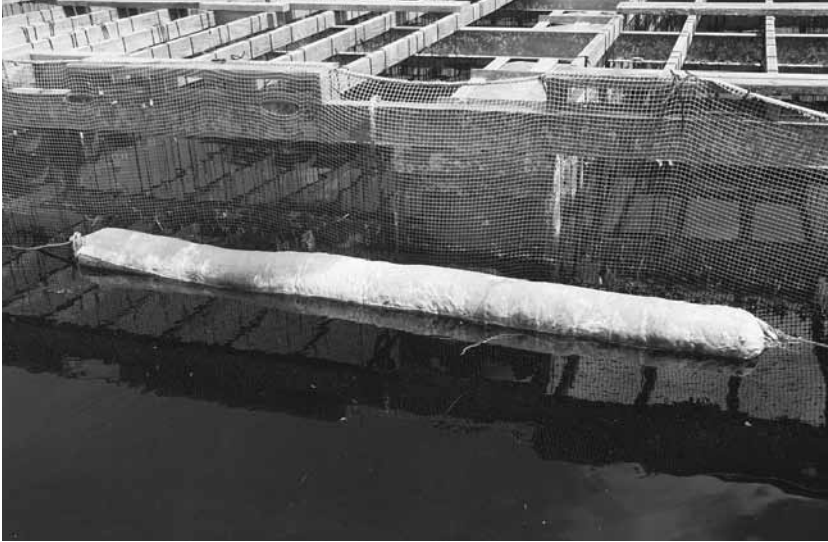
Fig. 9.3: Mycobooms™ are an invention by Paul Stamets which corral and degrade oil spills using oyster mushroom mycelium colonized on grasses — in this case, wheat straw.

communities as they age. Mycobooms™ are still in the experimentation phase, but definitely look promising. Stamets has also found a species of oyster that can tolerate salt water (as not all mushrooms can), which is key for marine oil spill response.