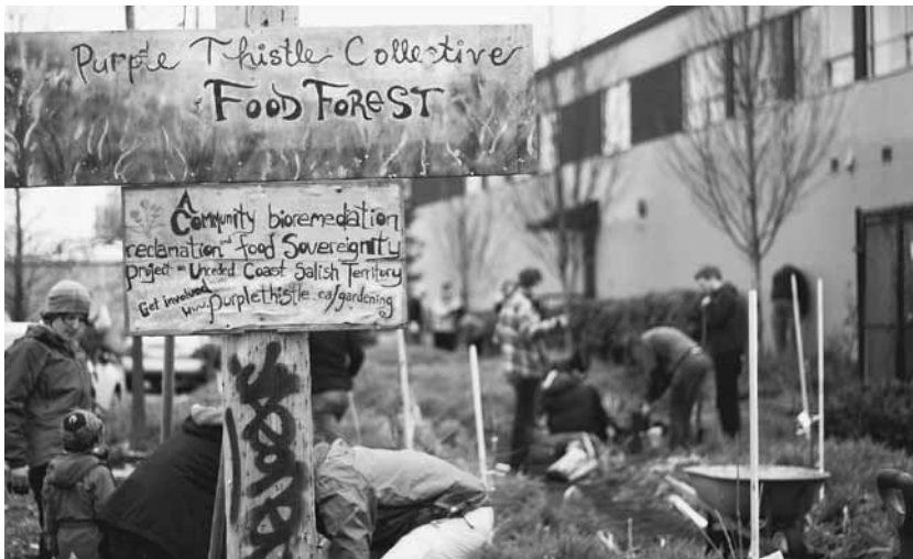
Fig. 5.6: Purple Thistle Food Forest sign.

The Purple Thistle is a youth-collective-run space for arts and activism, offering free art supplies, studio space, resources, classes, workshops and mentoring opportunities for youth in East Vancouver, BC, Canada. The Youth Urban Agriculture Project reclaims trashed marginal land in the industrial lowlands near Clark Drive and turns them into beautiful, bountiful permaculture gardens for growing