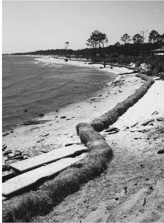
Fig. 9.2: Straw barrier in Dauphin Island.