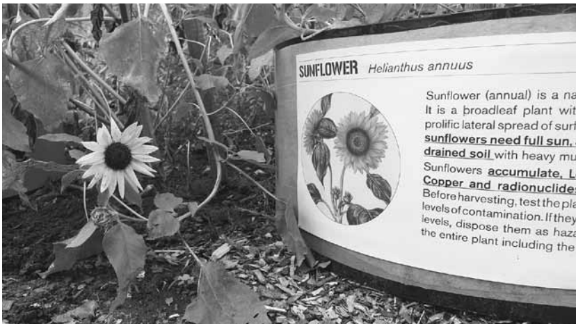
Fig. 5.2: Sunflowers — an easy-to-grow remediator.

Some of the plants that are good remediators may be available to you, but others may be harder to find. In this case, you may want to connect with specialty nurseries in your area or order seeds online. Universities may also be good allies for this. Your local native plant society can also prove really handy. Consider working with other folks in the community to start a local operation for growing key plants to assist in phytoremediation efforts. Hopefully, as more communities