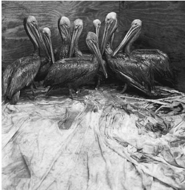
Fig. 9.5: Oiled brown pelicans in Louisiana.

For wildlife intake, assessment and stabilization, it would be highly advisable to have veterinary and wildlife professionals present. Handling of animals must be minimal. Any oil in and near their eyes, mouth and nostrils should also be flushed out with saline solution. During this time, it is critical that the birds and mammals are able to regain a healthy body temperature as soon as possible. Once warm