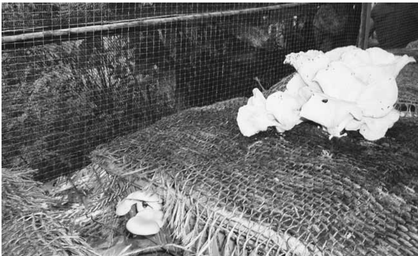
Fig. 6.25: Mushrooms growing from oily ex situ boxes.

Mia Rose Maltz: We've been putting some energy towards doing plant bioassays, in order to test the efficacy of the mycelial treatments, because we've spent tens of thousands of dollars on laboratory analysis