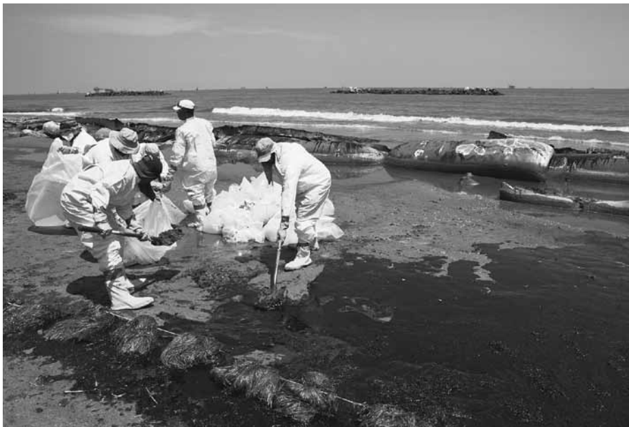
Fig. 9.4: Oiled beach in Louisiana.

crude). In conventional clean-up operations, shore and beach cleanup are usually where many community members end up volunteering their efforts because the work requires considerable human power and does not require previous experience.