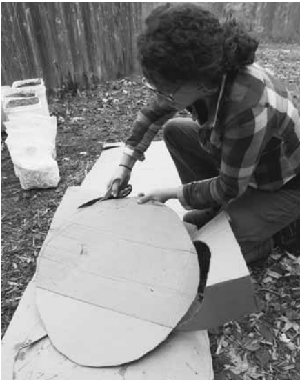
Fig. 6.12: Careful now!

4 th Step: Cover the holes in the bottoms of the containers with a layer of the perforated cardboard.