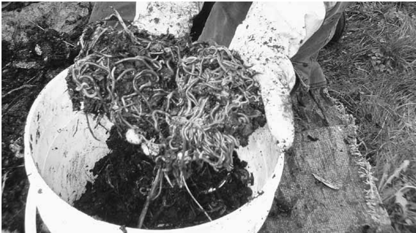
Fig. 4.2: Worm compost.

Worms provide several remediative and regenerative services to a contaminated site. Their movement and tunneling through the soil helps aerate it, which helps with making it more habitable for other beneficial microorganisms. As worms migrate, they disperse the pollutants and reduce contaminant concentrations in a given area. Because worms bioaccumulate heavy metals and organic contaminants and are able to consume up to 50 percent of their own body weight in food