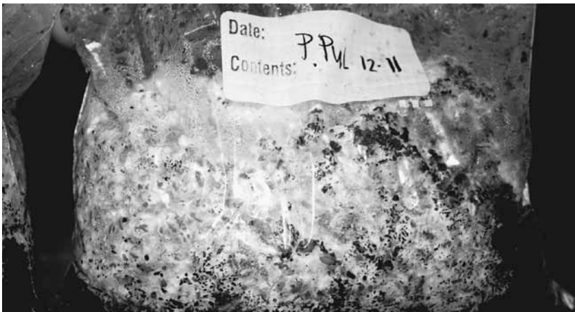
Fig. 6.4: Pleurotus pulmonarius growing on spent coffee grounds.