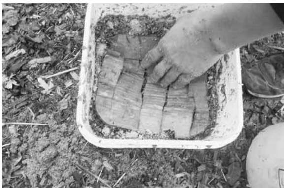
Figs. 6.19 and 6.20.