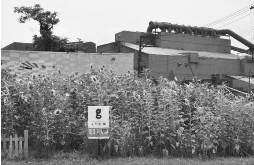
Fig. 5.11: GTECH project site.

Most GTECH projects revolve around small-scale community sites, not large-scale brownfields. As a result, getting access to the sites can be much easier and often quicker than working with companies who own the larger contaminated sites. GTECH also believes that not every vacant lot will become a green space in the long term. In some cases it makes more sense for a site to transition into affordable housing or some sort of local economic development projects instead. “Green groups focus on green outcomes, community groups focus on community outcomes. We focus on the intersection between the two,” added Butcher.