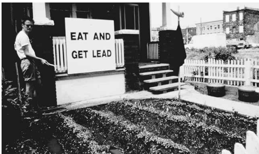
Fig. 5.9.