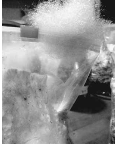
Fig. 6.3: Improved filter in Ziploc® bag.