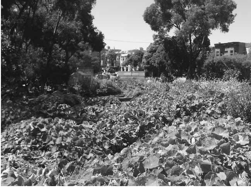
Fig. 5.5: Hayes Valley Farm today.

first place. Everything was designed with mobility in mind, for the day when the farmers would have to pack up and move to another site. The fruit trees were planted in pots, the cob ovens built on pallets, and the greenhouse is easy to dismantle. Even the new soil could be hauled away to a new site if necessary.