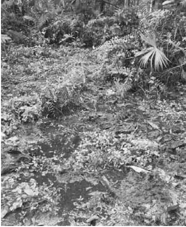
Fig. 6.23: A typical oil pit: thick, black petroleum and an oily sheen cover the ground of otherwise pristine rainforest. Thousands of unlined waste pools like this one can be found in the Ecuadorian Amazon, although “remediation” by the company is completed.