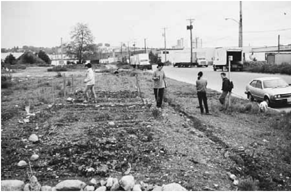
Fig. 5.7: Early days at the Cottonwood Community Gardens.

to decontaminate the front yard of a Toronto art gallery located in a neighborhood where much of the soil had been contaminated with lead from a nearby battery reprocessing factory. I sowed successive crops of buckwheat, which is known to absorb heavy metals, and I distributed pamphlets that detailed the injustice of a situation in which local people, predominantly working-class Italians and Portuguese, were no longer able to safely grow produce in their yards because of the actions of an unregulated polluter.