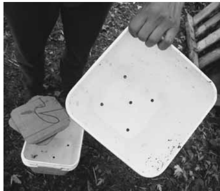
Figs. 6.10 and 6.11 : Supplies (left) and drainage (right) .