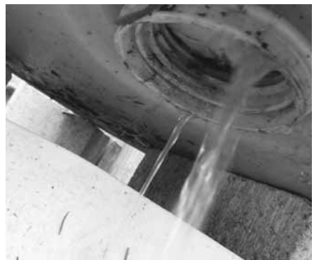
Figs. 6.14 and 6.15: Drain cover.