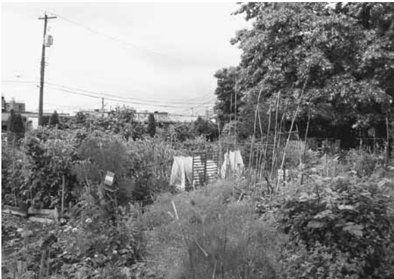
Fig. 5.8: Today at Cottonwood Community Gardens.