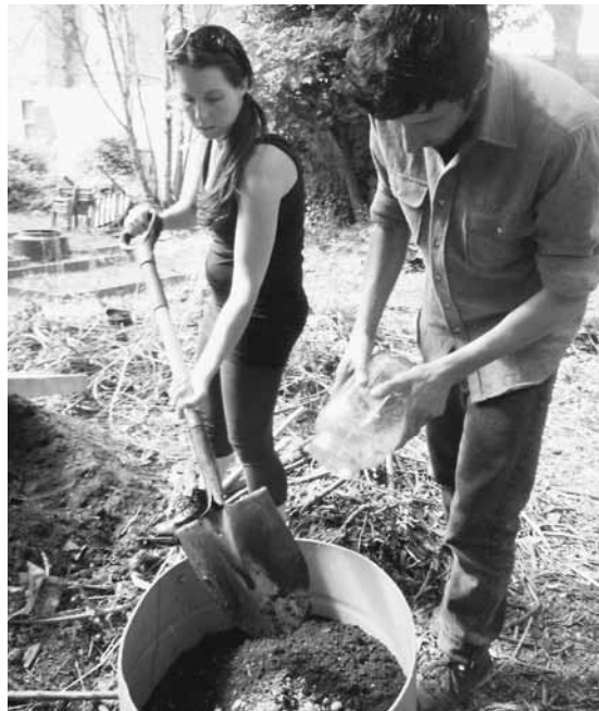
Fig. 6.9: In with the white elm (Hypsizygus ulmarius)!

The half barrels have a two-inch drain hole in the bottom, so we propped them five inches off the ground and placed a sediment catch under both of them. To simulate natural conditions as much as possible, the barrels were left outside in the open with just a layer of corrugated cardboard placed over the top. One and a half gallons of H. ulmarius spawn grown out on alder sawdust was added to each barrel and evenly layered every four inches. Each barrel had approximately 20 gallons of soil added into it. No further bioaugmentation was used. At three-month intervals these barrels will be tested for levels of toxicity, and test results will be posted at FungiForThePeople.org .