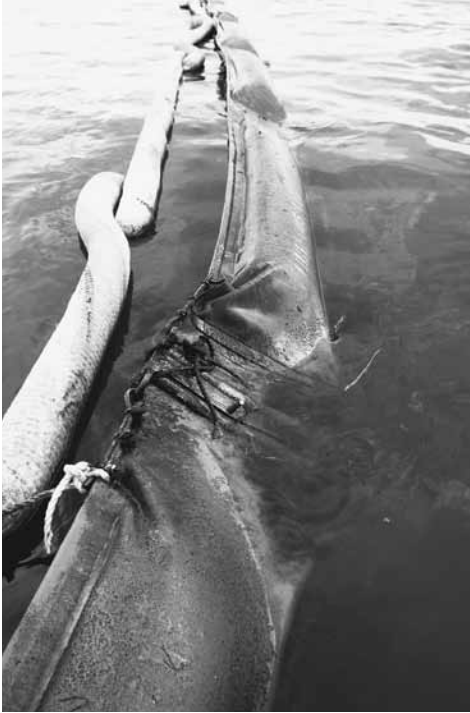
Fig. 8.1: Containment booms in Louisiana.