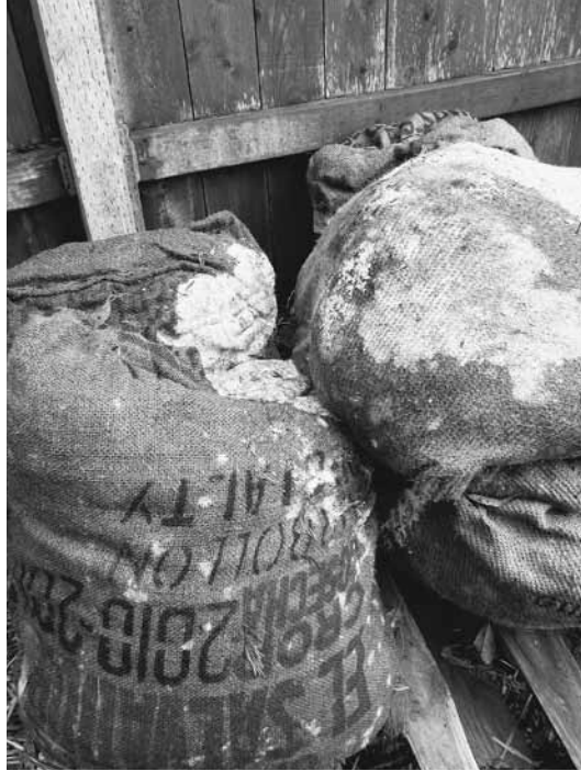
Fig. 6.6: Stropharia rugosoannulata bulk spawn growing through wood chips and burlap.