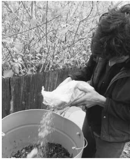
Figs. 6.17 and 6.18.