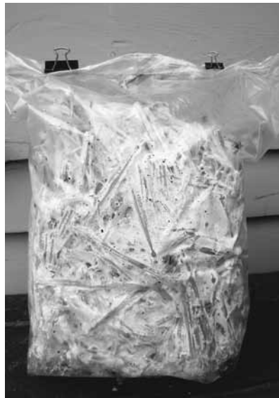
Fig. 6.5: Pleurotus pulmonarius growing on cold pasteurized straw, inoculated with sawdust spawn.