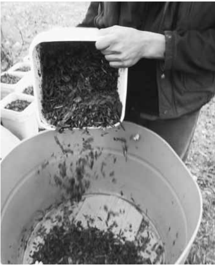
Fig. 6.16: Add wood chips.

6 th Step: Cover this layer with some of the mushroom spawn (in this case we are working with white elm). I also like to mist the spawn to make sure it is wet as well.