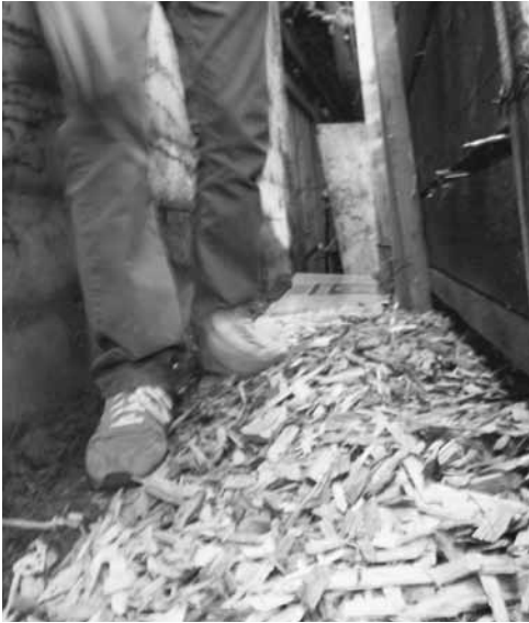
Figs. 6.7 and 6.8: Laying out wood chips and inoculating with king stropharia (Stropharia rugosoannulata)