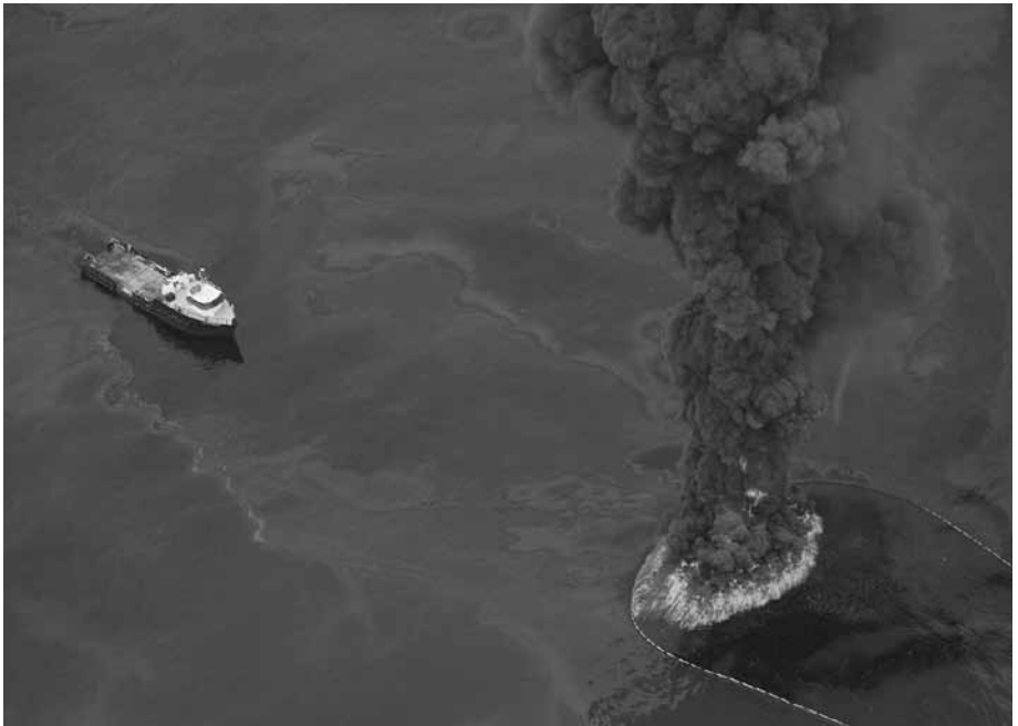
Fig. 8.2: Burning oil from oil rig disaster.

It is true that burning oil on-site does reduce the amount spilled and can keep an oil slick from smothering a coastline. But it is also true that burning spreads pollution in different ways. Whereas responsibility for and outrage from the public for an oil slick, tar balls on a beach