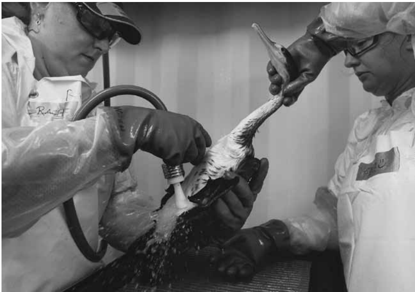
Fig. 9.7: Oiled cormorant in New Zealand.

With both washing and rinsing, consider where and how you will dispose of the used oily water. Depending on the severity of oiling, avoid pouring it outside or down the drain if you can, as that could lead to contamination of the surrounding environment.