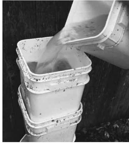
Figs. 6.21 and 6.22: Mature filter (left) and active filtration (right)

Upon the first few runs of water through these filters there is usually a discharge of reddish water. It is the tannins which may be leaching out of the wood. If under heavy use you will also find oils from the wastewater on output. To address this second problem, cycle the water back through at a slower rate which the filter can handle.