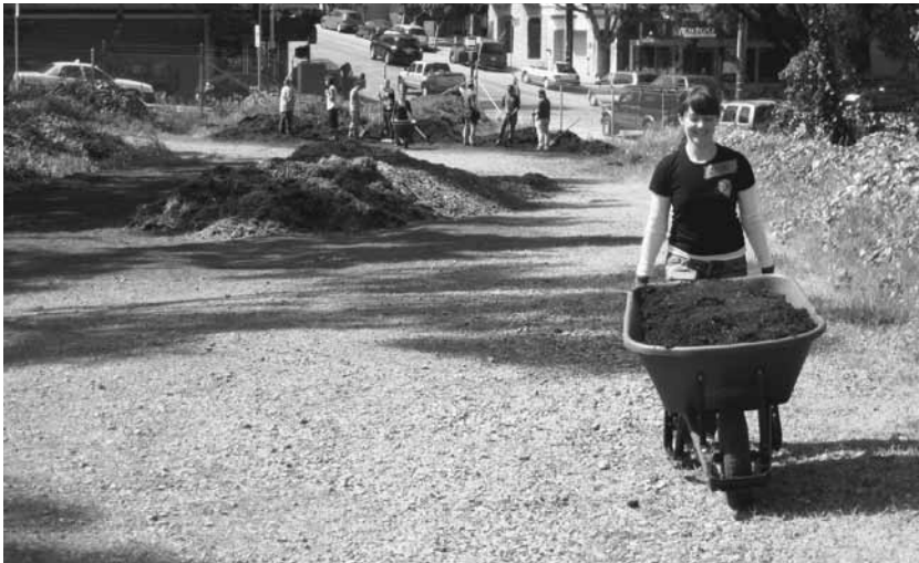
Fig. 5.3: Before shot. Looking down the highway off ramp at the site before sheet mulching.

Instead of removing the concrete to get at the contaminated soil below, the farm team took a different approach. “We used the existing concrete and pavement to seal most of the toxins in. One of the first things people thought we were going to do was remove the pavement. There is something romantic about breaking up pavement and revitalizing the earth,” explained Rosenberg. “But what I’ve learned here is that pavement can be a phenomenal seal. By layering horse manure, cardboard and wood chips right on top and by laying it on really thick, we are building ecosystems up, and that is more romantic than cutting through the concrete and then having to spend millions of dollars in hazardous waste removal of whatever else is under there after we open it up.”