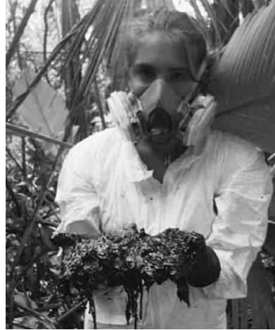
Fig. 6.24: A student with AMP holding the soil of the jungle floor which is heavily contaminated with crude, while conducting a biological survey of plant and fungal life in the 25-year-old petroleum pools.

Amazonian environment, being in the open air, exposed to heat and other localized variables. Usually, we put shade cloth or a roof over these open-air pits. Finally, we conduct off-site experiments in boxes, like milk crates, to test specific hypotheses in order to gather data with enough replication, randomization and statistical power that the data collected could eventually be published and presented to the greater community.