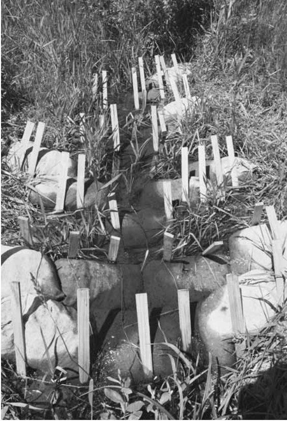
Fig. 6.28: Mycofiltration installation.