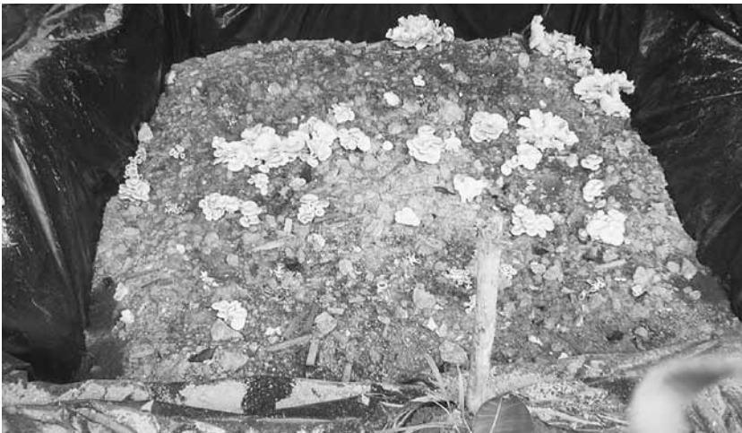
Fig. 6.27: After image of AMP bioremediation experiment. Pleurotus (oyster mushrooms) grows on oily substrate in open-air pits in Ecuador.