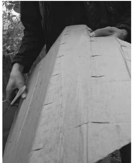
Fig. 6.13: Perforation.