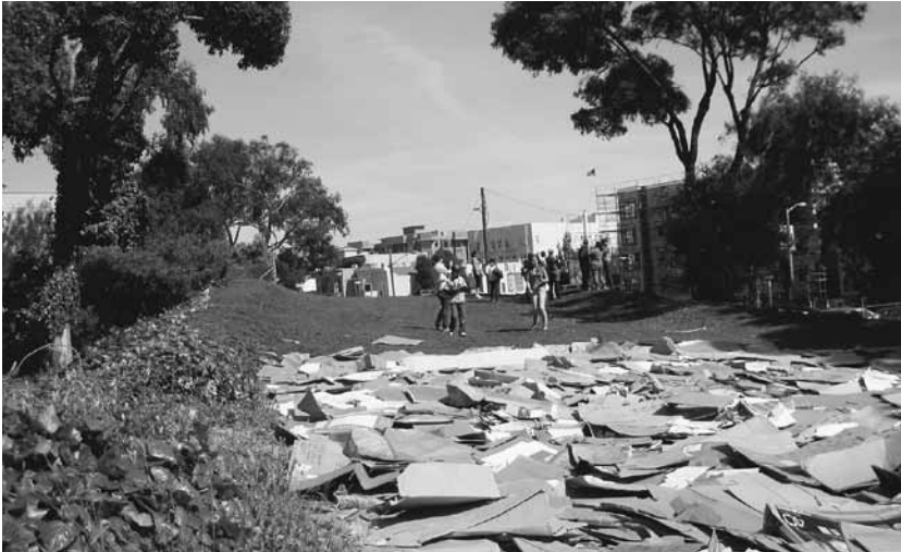
Fig. 5.4: Laying down cardboard and getting ready to sheet mulch and build soil at Hayes Valley Farms.