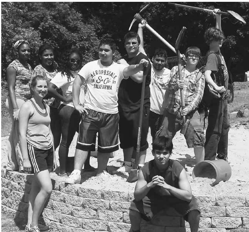
Fig. 5.10: The Toxic Soil Busters .

movers, shakers and educators. Youth are not the leaders of some utopian future. They are the change agents of today.