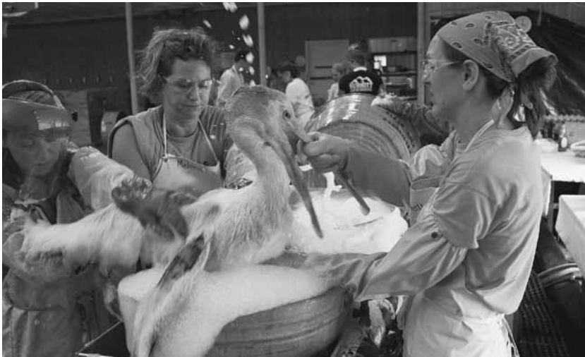
Fig. 9.6: Oiled white pelican in Louisiana.

Several bins, tubs or kiddie pools can be set up and filled with water and some form of dish soap in a low concentration. Dawn dish soap, especially the blue kind, is used by most recovery operations. It has the ability to get rid of most of the oils, is effective at low concentrations, rinses quickly from feathers and fur, is cheap and accessible and is supposedly non-irritating to the eyes and skin.